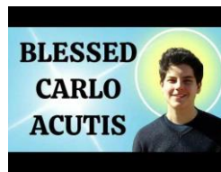
EXHIBIT ON EUCHARISTIC MIRACLES OF BLESSED CARLO ACUTIS

Displays include a history of the Feast of Corpus Christi, Eucharistic Adoration, and Eucharistic Processions.