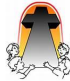
Children's Stations of The Cross